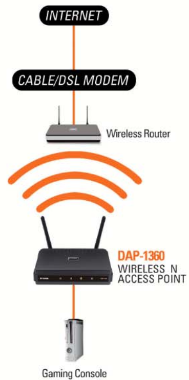
Ethernet-enabled gaming console using the DAP-1360 as a wireless interface to access the Internet