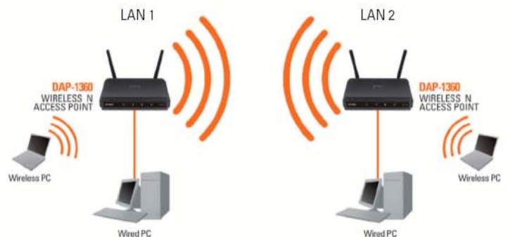
Connecting two separate LANs together through two DAP-1360 units (Wireless PCs can access the DAP-1360 units)